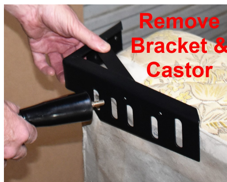
Step 7: Remove castors and bed head brackets from the ensemble ready for attaching to bed head.