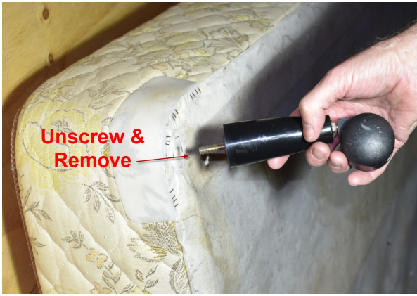
Step 1: Unscrew and remove castor