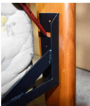
Step 6: Mark bolt hole positions.