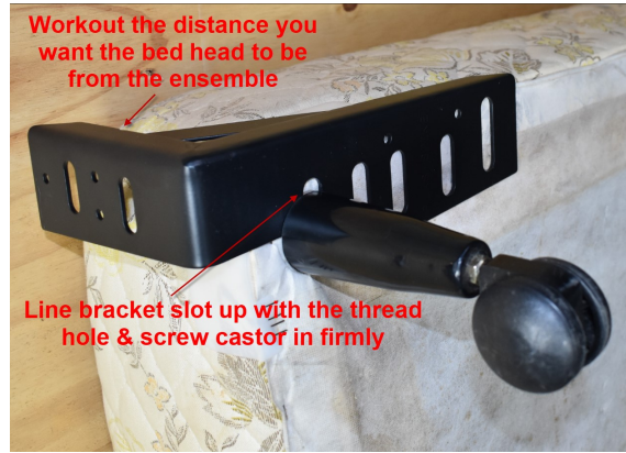
Step 2: Workout the distance you want the bed head to be from the ensemble mattress & base then line the bracket slot up with the thread hole that matches that distance and screw castor in firmly .