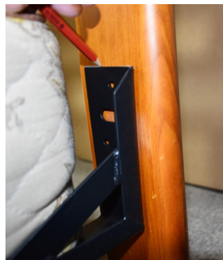
Step 4: Make a small mark on bedhead where the bracket will be attached