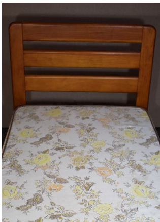
Step 3A: Place bedhead on the floor and sit it flush against the brackets ready to measure and mark out screw holes and bracket position.