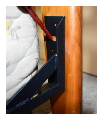
Step 6: Mark bolt hole positions.