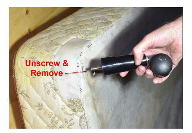
Step 1: Unscrew and remove castor