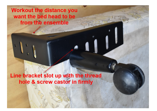
Step 2: Workout the distance you want the bed head to be from the ensemble mattress & base then line the bracket slot up with the thread hole that matches that distance and screw castor in firmly.